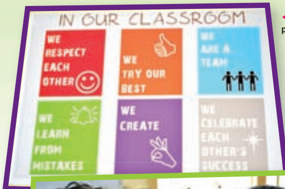
◀ Establishing rules for a happy and productive classroom in the Open School