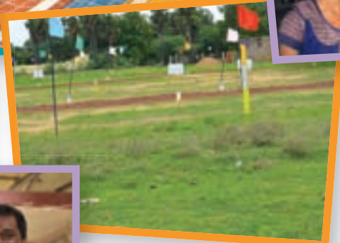
▲ Planning for the future... watch this space!