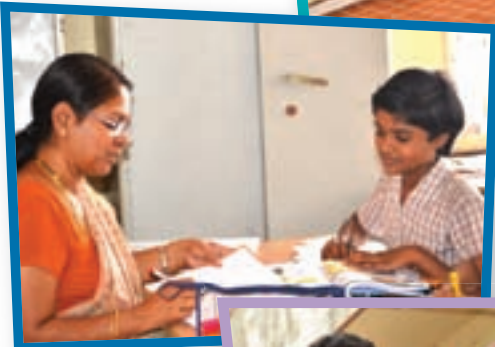
▲ Ensuring our motivated teachers have the training they need to deliver effective and inspiring lessons