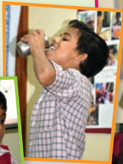
▲ Providing clean water...