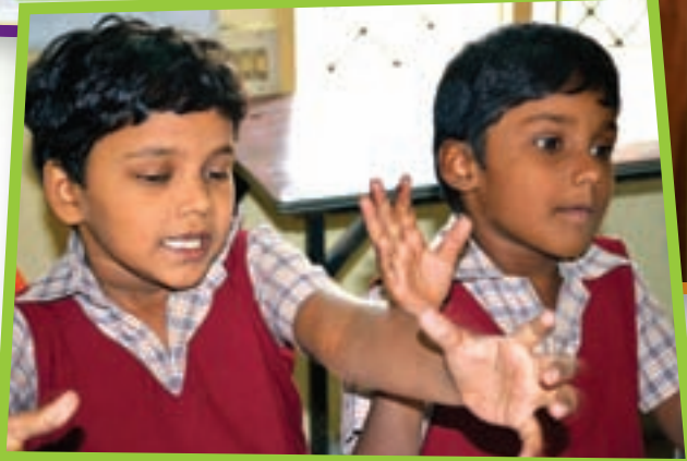
▲ Going on a bear hunt with 3rd standard