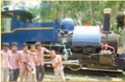
A trip to the Railway Museum