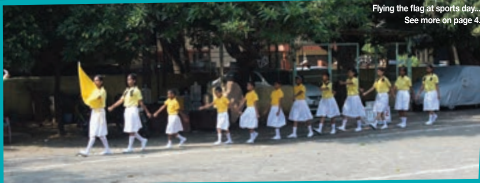
Flying the flag at sports day... See more on page 4.